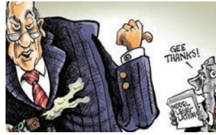
Cartoonist Phil Tes | p. 5