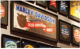
Milwaukee Hnub Mus Ncig | p. 2