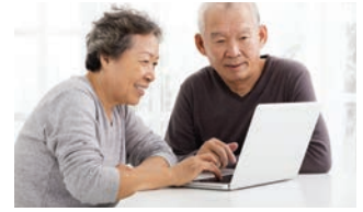
Pab Nyob & Senior Tsev cog lus | p. 5